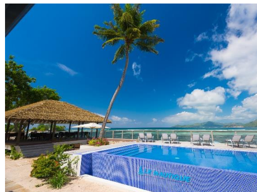
Pool deck and restaurant

With a contemporary design, all guestrooms feature comforts such as handmade king beds, luxurious bedding, free WiFi, walk-in rain showers, flat screen TVs with cable channels, air conditioning, Nespresso machines and mini-bars. Ideally located at La Passe in the centre of the village.