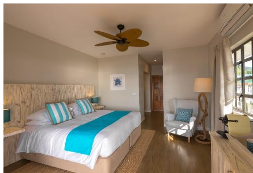
Garden view room