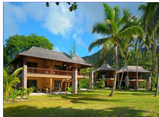
View of Villa

ZEE BAR – Main bar and lounge near the reception