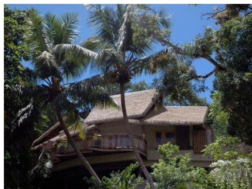
Exterior of Villa de Charme

INFINITY POOL BAR – A swim-up pool bar for enjoying refreshments from the cool confines of the pool overlooking the sea.