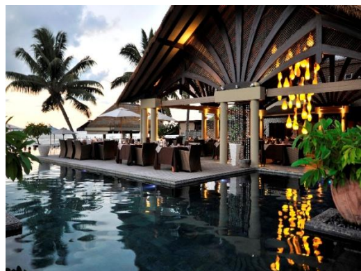
Le Combava Restaurant