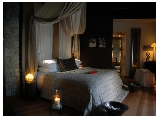
Villa de Charme