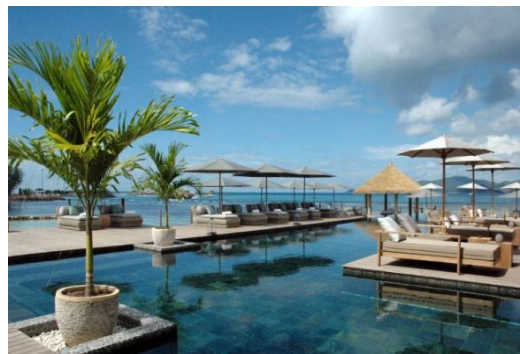
Sea & Pool View