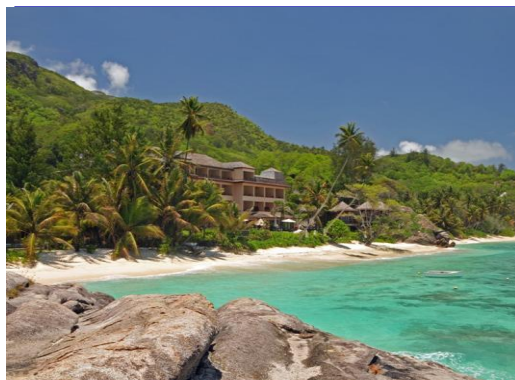
Back view of hotel

Traditional and modern therapies are offered at the Duniye Spa, with 3 double treatment rooms with Ocean view, an outdoor relaxation area and a fitness gym